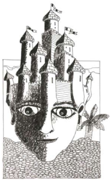
The Redoubt 1 - Artur