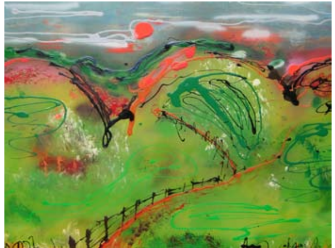
Spring Hills - Leigh Kibby